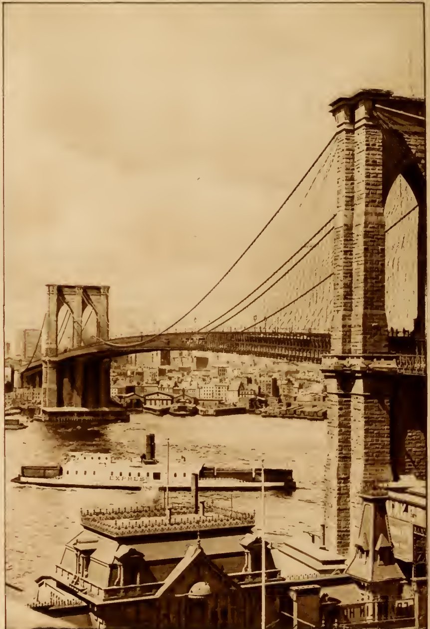
BROOKLYN BRIDGE, over East River, from Park Row, Manhattan, to Sand Street, Brooklyn. Begun in 1870, finished in 1883. Cost $21,000,000.